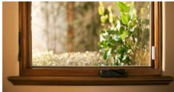
Window Contact Sensors in View

-Communication should be available in designated safe areas, safe rooms, etc. with emergency number and emergency contacts stored into the phone and/or written next to it.