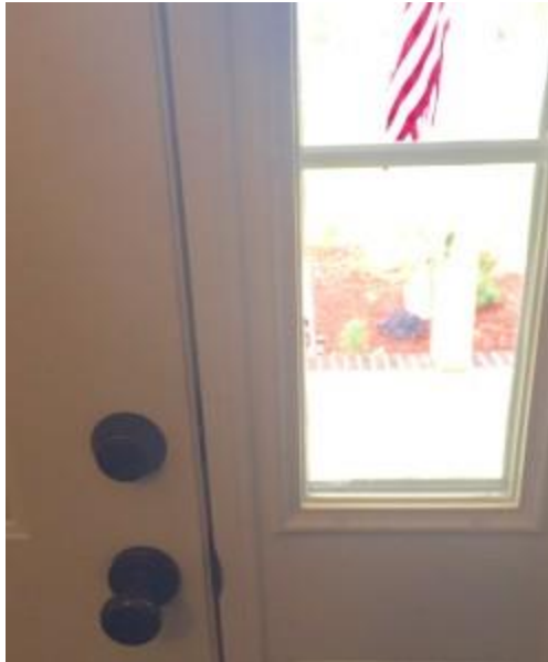
My Front Door - Note Double Dead-Bolt near window and American Flag.

Below are the most cost-effective methods to deter criminal acts and keep your assets safe.