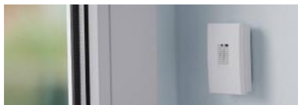
Glass Break Detector

-A safe must be selected based upon its intended function - a document safe is intended to protect against fire, a security safe is designed to protect valuables, etc. and should always be well concealed, fixed to the floor or embedded in foundations.